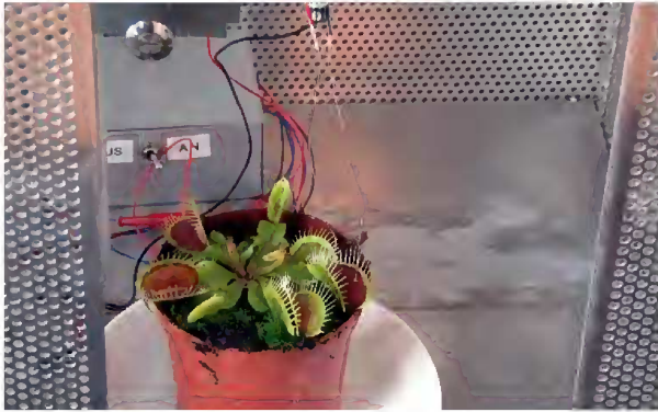
Figure 6: Measurement of action potentials on Dionaea lobes in 2009 (a rewarded experiment by students of the Friedrich-König-Gymnasium in Würzburg, Germany).